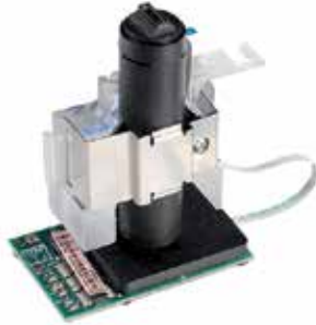
HP Optical Media Advance Sensor (OMAS)

Turn orders in record time with the fastest 60-inch production printer for graphics. 6 Offer exceptional color and black-and-white prints on many substrates with 8 HP Vivid Photo Inks. Count on advanced color management features backed by HP reliability and easy operation.