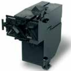
Spectrophotometer with i1 color technology from X-Rite